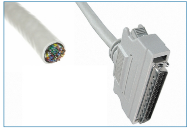
Punch Down Cable

IP/IPX over Frame Relay/ PPP/HDLC/X.25, X.25 over Frame Relay (Annex G), BSC over X.25, SNA over X.25, PPPoE, PPPoA, IP over ATM