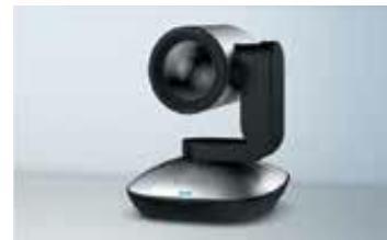
Sitting on table or ledge