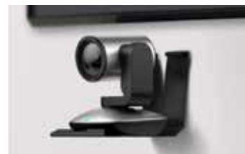
Mounted on wall